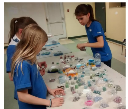
Northern Lights Guides held a jewelry craft night where each girl made her own chain.