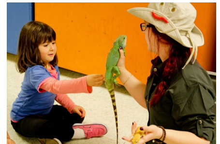
Northern Lights Sparks invited Educazoo to come visit them and made friends with many creatures!