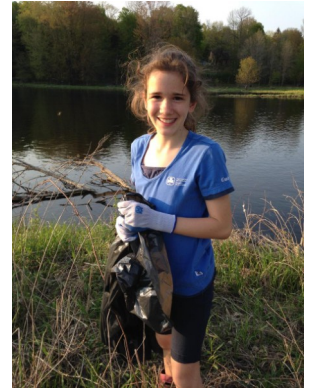
Secteur Argenteuil girls and families participated in the Great Canadian Shoreline Clean-up!